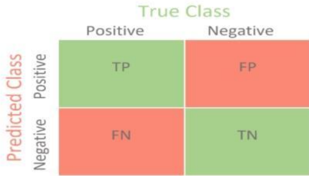
Figure 3. Multi-class confusion matrix

b. Confusion matrix multiclass : Unlike binary classification, there is no positive or negative class in this. We have to find for each individual class TP, TN, FP, and FN.